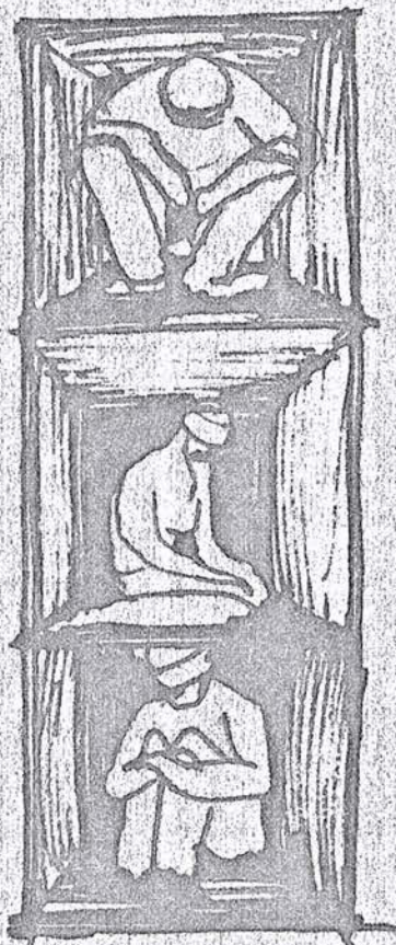
VILLA GRIMALDI : LAS TORRES